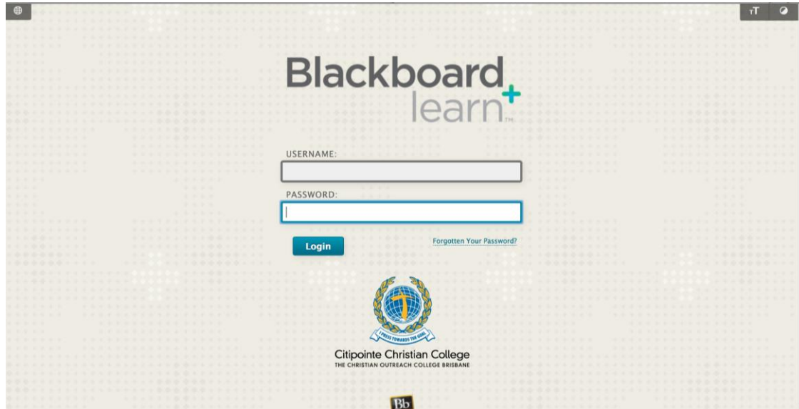
The Blackboard login page

Blackboard is the College online Learning Management System. It has replaced C3B.net as the online learning environment and it contains a host of subject specific content, information and activities for students.